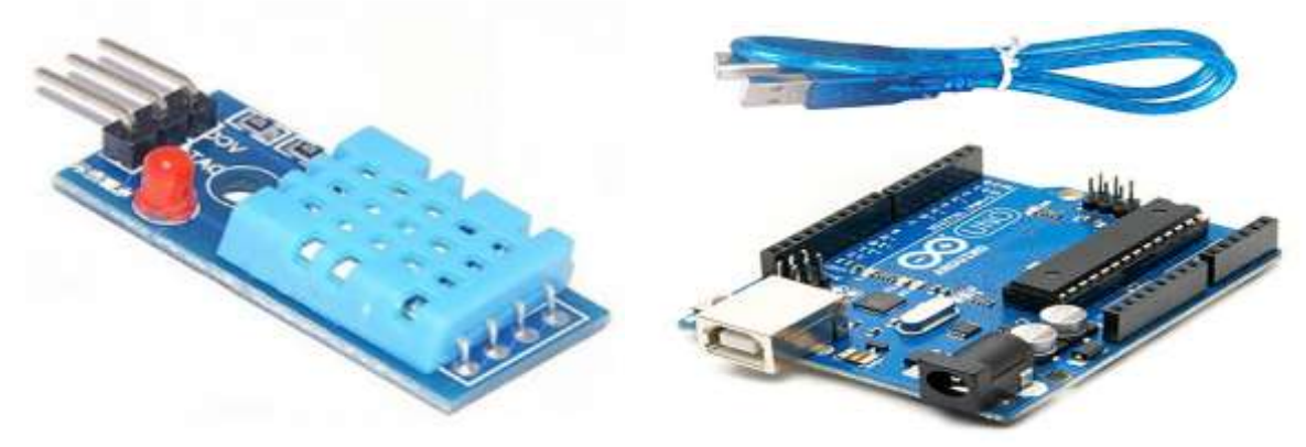
Diagram of Arduino and DHT11 Sensor

operator monitors room every month in order to ensure the cool temperature. In this research, a system that can monitor the temperature and humidity of the PoP room directly anytime and anywhere is proposed. This monitoring system is based on the microcontroller and the web service. The proposed system will make monitoring PoP room becomes much easier and effective. [5]In order to ensure that the server's performance is not impacted by excessive room temperature and humidity, real-time monitoring of the room's temperature and humidity has become essential. Increases in server room humidity and temperature that are unchecked and unregulated could harm equipment. While the Bicubic method interpolates data points on a two-dimensional grid, the Color mapping technique alters the temperature colours of the image collected by the IP camera. When the temperature and humidity in the server room exceed the critical value, the system is designed to send an alarm to the administrator.[6]